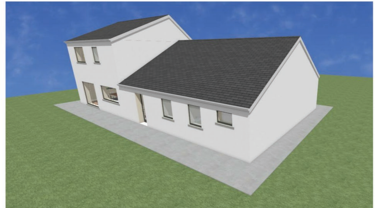
"THE ROSSMORE 2"